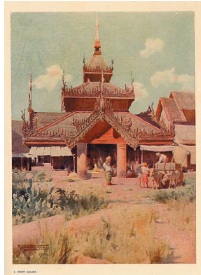
A REST HOUSE.

These flowers and coloured candles are sold upon the platform, leading up to which are several covered staircases, which form the best bazaar in Rangoon, as in the shops on either side of the ascent